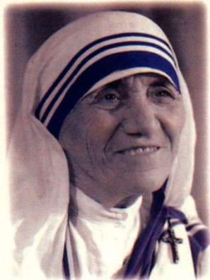
Mother Teresa of Calcutta

Annual Priest Appreciation Dinner The Double Tree/Lloyd Center