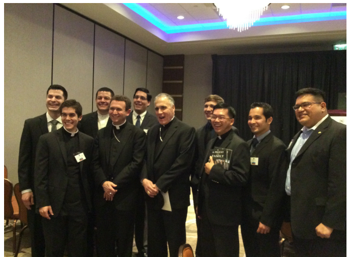
After Saturday night banquet Archbishop DiNardo & Bishop Cozzens take time for a photo with seminarians!!