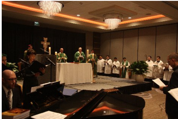
Photo Above: Mass on Saturday night celebrant was His Eminence Daniel Cardinal DiNardo, Archbishop of Galveston-Houston